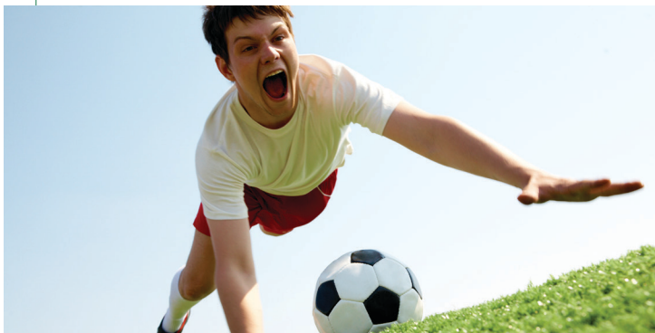
Example of a fall causing a shoulder dislocation

Shoulder dislocations can occur from repetitive trauma, an injury or accident. Dislocations occur when the shoulder is forced out of place from falls or sports injuries.