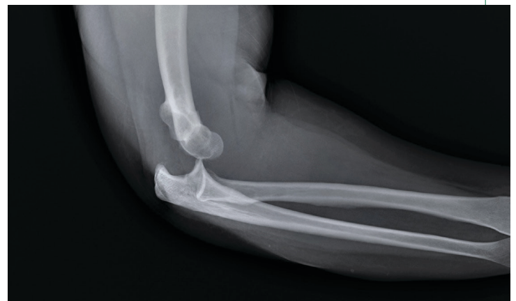
X-ray of a dislocated elbow

A hand therapist will work closely with the surgeon to help treat a terrible triad injury. The hand therapist may make an elbow orthosis to support and protect the elbow. The therapist will also educate the patient on how to reduce swelling, decrease pain and safely improve range of motion and strength of the elbow.