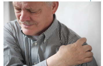
Rotator cuff tears may cause pain in the upper arm

If there is a tear, there may be pain in the upper arm, which can worsen with movement, lifting, poor posture and sleeping. Depending on the type of tear, there may also be difficulty lifting the arm or reaching behind the head and back.