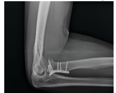
X-ray of a radial head fracture after surgery

A hand therapist works directly with a doctor to assist with treating a radial head fracture. A custom orthosis to support and protect the elbow may be made. The therapist will also educate the patient on how to reduce swelling, decrease pain and regain motion and strength of the elbow, wrist and hand.