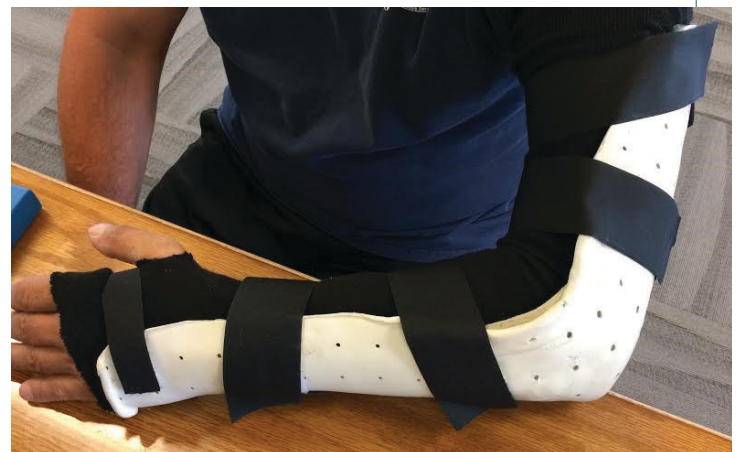
Example of a custom elbow orthosis for a radial head fracture

A fractured radial head may cause a decreased ability to move the forearm and elbow. There may also be swelling, pain and bruising in the elbow or forearm. At times, the elbow may have an abnormal appearance and numbness may be felt in the back of the hand and thumb.