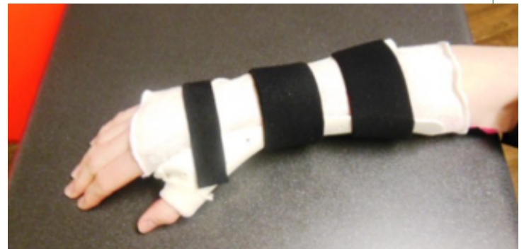
Example of custom orthosis for wrist and thumb following an LRTI procedure

If arthritis pain at the base of the thumb is present after non-surgical treatment, an LRTI procedure may be recommended