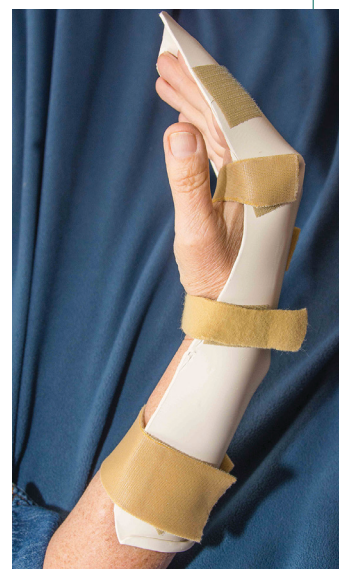
Example of flexor tendon orthosis to protect the injured finger

To locate a hand therapist in your area, visit the American Society of Hand Therapists at www.asht.org or call 856-380-6856.