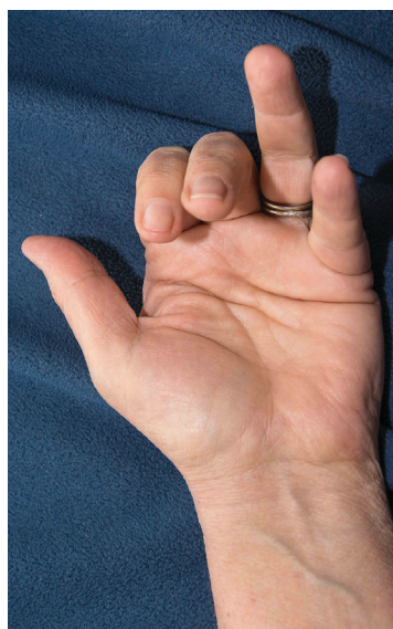
Example of an injured ring finger flexor tendon in which the finger is held straight instead of bent

A hand therapist is an important part of post-surgical care. After surgery, the hand therapist will fabricate a custom-made orthosis and start a protected exercise program. The goals of therapy are to provide gentle motion to the healing tendon in order to prevent scarring and to prevent separation of the tendon. The physician, hand therapist and patient work together as a team in order to achieve the best possible outcomes after a flexor tendon injury.