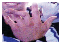
Example of a lateral PIP dislocation after a motorcycle injury

A dislocated finger is usually obvious, but not always. The finger may appear crooked or bent and can be painful, swollen, bruised and difficult to move. There may be numbness or tingling and the finger may have a pale color. Some dislocations may cause the skin to tear.