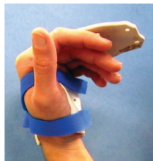
Example of an orthosis to protect ring and small fingers dorsal dislocations

A hand therapist may fabricate a custom orthosis to protect the finger as it heals. Regaining the movement and strength of the hand will be a focus of treatment. A hand therapist works with the patient in order to achieve the best possible outcome after a finger dislocation.