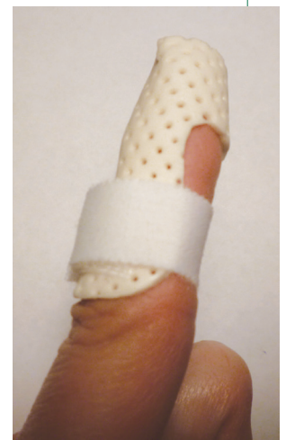
Example of orthosis for “Mallet Finger”

A hand therapist provides specialized care including non-operative and post-surgical treatment for extensor tendon injuries. A specialized hand therapy program may include a custom-made orthosis, and therapeutic exercises to restore motion and function of the hand. The physician, hand therapist and patient work together as a team in order to achieve the best possible outcomes after an extensor tendon injury.