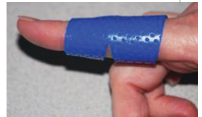
Example of custom finger orthosis for boutonniere deformity

To locate a hand therapist in your area, visit the American Society of Hand Therapists at www.asht.org or call 856-380-6856.