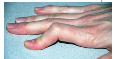
Index finger boutonniere deformity showing bent PIP joint and a straight DIP joint

For a boutonniere deformity that does not require surgery, a hand therapist will make a custom orthosis to place the finger in a proper position for correct healing. The therapist will also instruct the person in techniques to reduce swelling in the finger. The person must use the orthosis as instructed in order to achieve a good outcome. For injuries requiring surgery, the hand therapist will make an orthosis after surgery and instruct the patient in management of the scar. The hand therapist will also instruct the person in a specialized home exercise program that will assist with return to normal hand function.