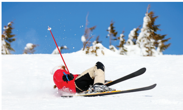
Holding a pole during a fall can cause a skier's thumb injury.

Most often, injuries occur during sport or recreational activities, such as skiing, football, biking and soccer. Any extreme force to the thumb in the opposite direction can cause a sprain or strain, but injuries can also occur as a result of a fall, or jamming the thumb.