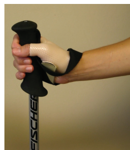
Custom orthosis to protect UCL injury to the thumb

A therapist can make a custom orthosis to rest the thumb ligament as it heals. While the ligament is healing, the therapist will provide gentle exercises for the other joints of the hand. After the ligament has healed, the therapist will progress exercises to increase function and strength in the hand and thumb.