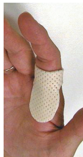
Orthosis for Trigger Finger

The physician may refer the patient to a hand therapist for non-operative and post-surgical treatment. For non-operative treatment, the certified hand therapist has specialized training to fabricate a custom orthosis to rest the finger, and to teach the patient exercises to avoid stiffness during the healing process. The certified hand therapist will also discuss ways to modify activities while the finger is healing. Hand therapy following surgery will improve range of motion, and teach the patient how to regain the function of the hand.