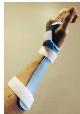
Orthosis for tennis elbow to help rest the affected area.

A hand therapist can provide conservative management for the treatment of tennis elbow, with the goal to return the patient back to normal work, home and sports activities. A therapist can help identify what activities might aggravate symptoms, and discuss activity modifications. A custom-fabricated brace or orthosis for the wrist might be recommended to rest the area. Various treatments can be utilized, such as heat, ice, ultrasound, massage or electrical stimulation. The therapist will often prescribe stretching and strengthening exercises. Following any surgery for tennis elbow, therapy is important to regain motion and strength.