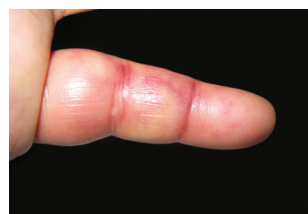
Finger fracture with swelling and bruising

Fractures can cause pain, throbbing, swelling and bruising, and the finger might look deformed or out of place. There will also be limited motion or inability to move the fractured finger and also the other