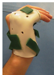
Custom-made orthosis for a hand fracture

A hand therapist is extremely important in the rehabilitation of hand fractures. The therapist can fabricate a custom orthosis that provides proper