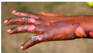
Example of a burn to the back of the hand

Our hands are at greater risk for burns because they are often handling a variety of objects. Hand burns occur when cells in the skin are injured due to contact with heat, electricity, chemicals or radiation. When a hand is burned, the skin can become very tight, making it hard for a person to use his or her hand normally.