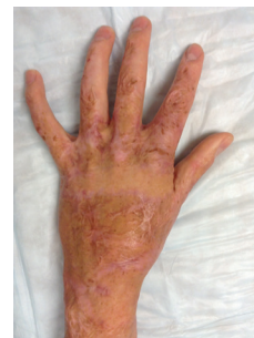
Photo of healed hand burn and scarring

The treatment of a hand burn depends on the severity of the burn. First-degree burns require minimal treatment. Second-, third- and fourth-degree burns will require wound care, possible skin grafts by a hand surgeon and early hand therapy to prevent stiffness of the joints and skin (scarring). The treatment of hand burns has become more advanced as newer wound care bandages assist with healing.