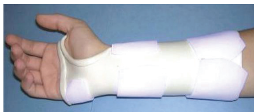
Custom-made orthosis to limit motion in a wrist with a ganglion cyst

A hand therapist will help determine which activities should be avoided. A hand therapist may also make a custom orthosis to limit joint motion. If surgery is performed, treatment will include exercises to restore the range of motion, strength and function of the hand. Other treatments may also be used to help manage pain and scarring.