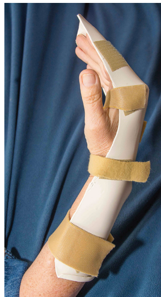
Example of flexor tendon orthosis to protect the injured finger

A hand therapist is an important part of post-surgical care. After surgery, the hand therapist will fabricate a custom-made orthosis and start a protected exercise program. The goals of therapy are to provide gentle motion to the healing tendon in order to prevent scarring and to prevent separation of the tendon. The physician, hand therapist and patient work together as a team in order to achieve the best possible outcomes after a flexor tendon injury.