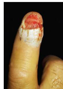
A fingertip injury showing damage to the nail

Fingertip injuries can cause bleeding, bruising and swelling. There may also be decreased feeling and a change to the shape of the finger. Some fingertip injuries may develop an infection. Due to nerve endings on the tip of the finger, these injuries may be painful and sensitive when touched.