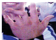
Example of a lateral PIP dislocation after a motorcycle injury

A dislocated finger is usually obvious, but not always. The finger may appear crooked or bent and can be painful, swollen, bruised and difficult to move. There may be numbness or