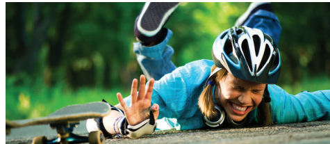
Example of a fall on an outstretched hand or wrist called a FOOSH

A distal radius fracture is usually caused by a fall on an outstretched hand or through contact sports and physical activities. Bones make up our rigid skeleton, and when a lot of force is put through them, they can break. A number of risk factors, such as low bone density or osteoporosis, may make it more likely for a distal radius fracture to occur.