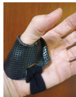
Orthosis for basal joint arthritis

Initially, a hand therapist can provide patient education including use of adaptive equipment, activity modification and special exercises to help reduce pain. A hand therapist can also provide a custom-fabricated brace or orthosis that will allow the thumb joint to rest and will provide support while performing daily activities. Hand therapy following surgery improves range of motion, and teaches the patient how to regain the function of the hand.